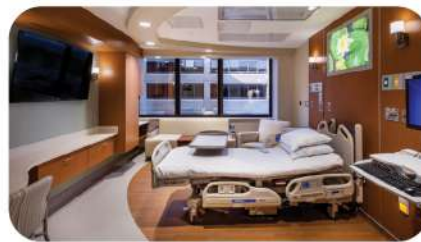
₹ 2 crore allocated to JJ Hospital for transplant units.