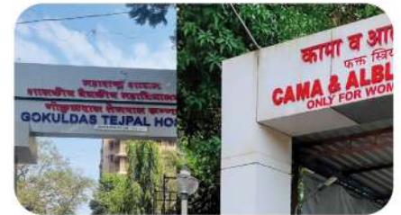
New Govt. Medical College at GT & Cama Hospitals.