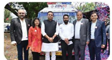
Free ambulance services for underprivileged residents.