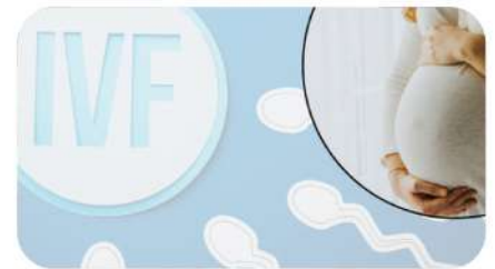
New IVF unit at Cama Hospital, enabling parenthood for underprivileged families.