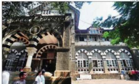
Cath Labs at JJ Hospital are not fully functional since many months