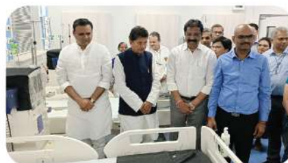
Upgraded facilities & new healthcare initiatives.