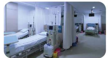
First aid centre for ICU casualty departments.