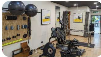
Physiotherapy Centre established.