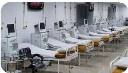
Dialysis services started at 4 major hospitals.