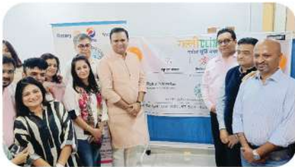
Gully Clinics launched for underserved areas.

Our healthcare initiatives are built on the belief that every citizen deserves access to quality medical care, regardless of their background or financial situation. We are proud to share some of the ways we are working to make this vision a reality.