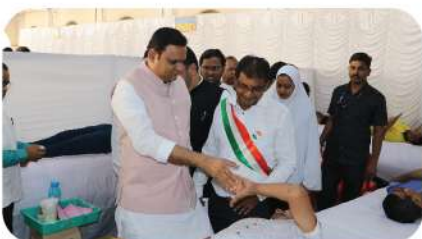
Regular health camps for preventive care.