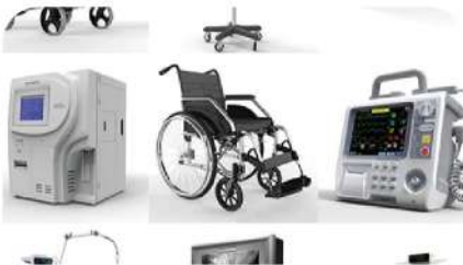
₹ 18 crores worth of new medical equipment.