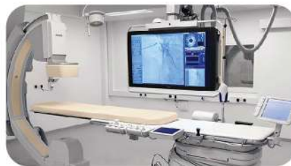
Advanced Cathlab machinery at JJ Hospital.