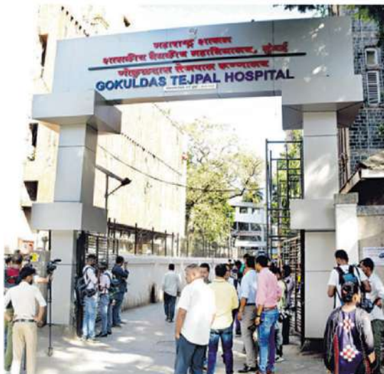
Gokuldas Tejpal Hospital in south Mumbai.

Fifty students to be admitted in first academic session, intake to double next year